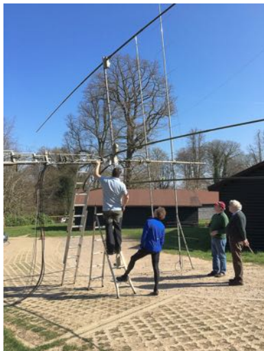
Day 1 - Aerial removal

Thanks to all those involved - day 1, G0KAD, G3YSX, G3VKW, G4PEO & M0WID , day 2, G0KAD, G3YSX, G3VKW, G4PEO, M1YAP, M0TZZ, G6NQO & M6HNJ which ensured a very successful outcome.