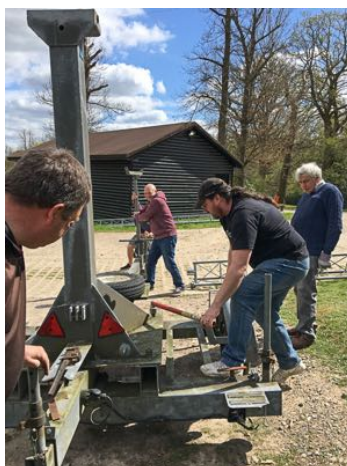
Day 2 - Muscle power required!