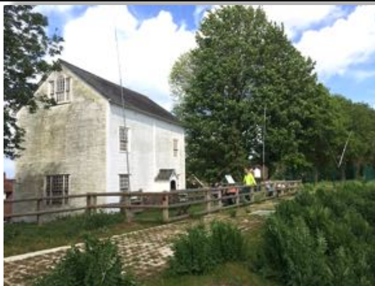
Mills-on-the-Air, GB0IWM, operated by CARC members at Ifield Watermill. See Page 4