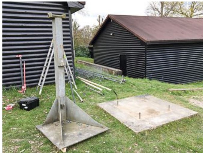
Day 2 - 'Old' mast dismantled & ground post removed