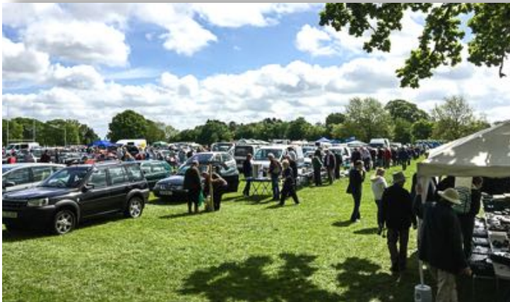
Dunstable Downs Radio Club Bootsale . Photo only shows a part of the event held in pleasant grounds with a friendly atmosphere, together with a cafe and outdoor seating within the park - well worth a visit especially if the weather is kind as it was this year.