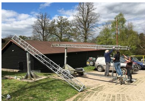
Day 2 - 'Old' mast onto the trailer; 'new' mast partially built.