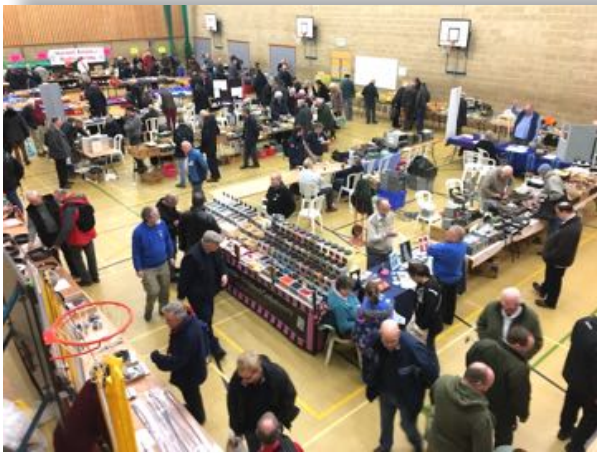
Harwell Rally - large hall plus a number of smaller rooms. Notably a large but packed/uncomfortable refreshment area.

2017 Rallies - The rally season is upon us again, (was it ever closed?), and various club members have made the pilgrimage to a number of them. Although cancelled this year, the Eastbourne Rally (SERF) will be held next year on Sunday, 6th May. It is intended that a Sunday in May will become SERFs 'regular' spot.