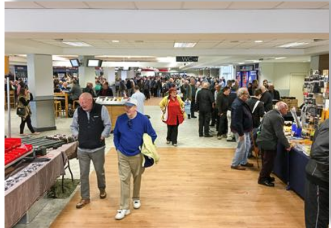
Kempton Park Rally - Still going strong, although without ML&S or W&S this year, and, despite the rumours, it was announced the rally will still be with us until at least 2022.