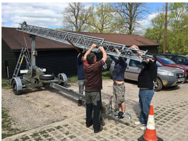
Day 2 - Removal of replacement mast from trailer