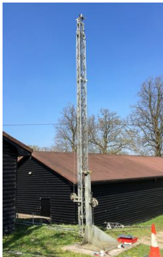
Day 1 - Bare mast