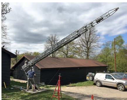
Day 2 - Job done - test erection of mast.