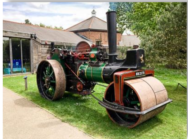
Amateur radio wasn't the only attraction at Dunstable, traction engines were also in attendance in the very pleasant Stockwood Park grounds. What more could you ask for!